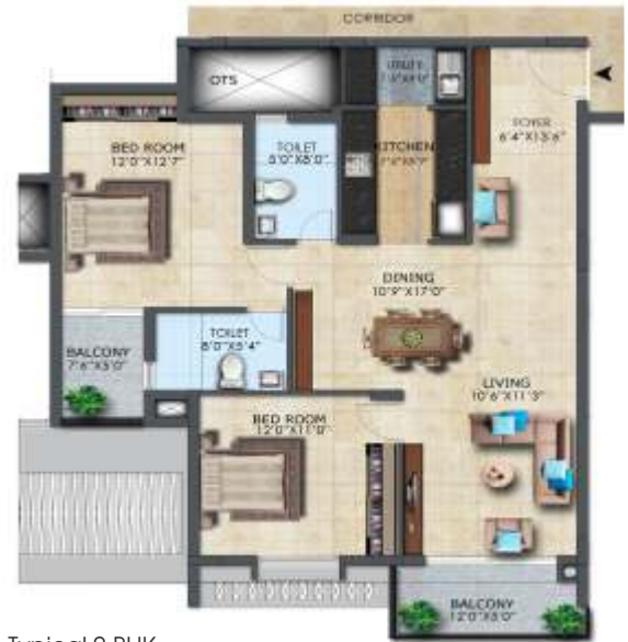
Typical 2 BHK SBA : 1320 sft. Builtup Area : 1033 sft. RERA Carpet Area : 860 sft. RERA Balcony : 94 sft.