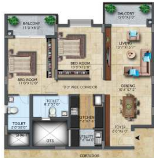
Typical 2 BHK SBA : 1232 sft. Builtup Area : 946 sft. RERA Carpet Area : 752 sft. RERA Balcony : 113 sft.