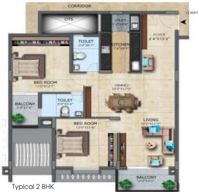
Typical 2 BHK SBA : 1305 sft. Builtup Area : 1019 sft. RERA Carpet Area : 846 sft. RERA Balcony : 94 sft.